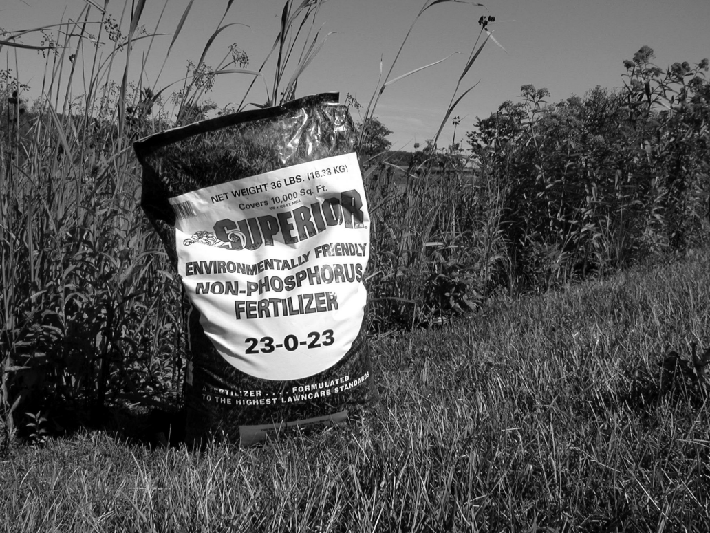
Use only phosphorus-free fertilizer like this on your lakefront property.

can contribute to better water quality—regardless of where you live. When shopping for lawn fertilizer, look for the three numbers on the lawn fertilizer bag. The middle number indicates the phosphorus content of the fertilizer—so look for a 0. The other numbers indicate the amount of nitrogen (first number) and potassium (third number) in the fertilizer. Phosphorus is needed only on newly seeded lawns or where soil testing indicates a deficiency.