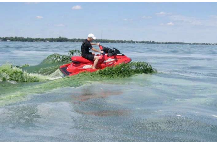
A personal watercraft creates a green wake.

Over the years, the lake has become increasingly enriched by phosphates and nitrates from a number of man-made and natural sources. These nutrients have contributed to the decline of the lake's water quality. Ohio EPA and various state and local partners have been working within the lake's watershed for many years to achieve improvements along streams that feed the lake, which in turn will improve water quality in the lake.