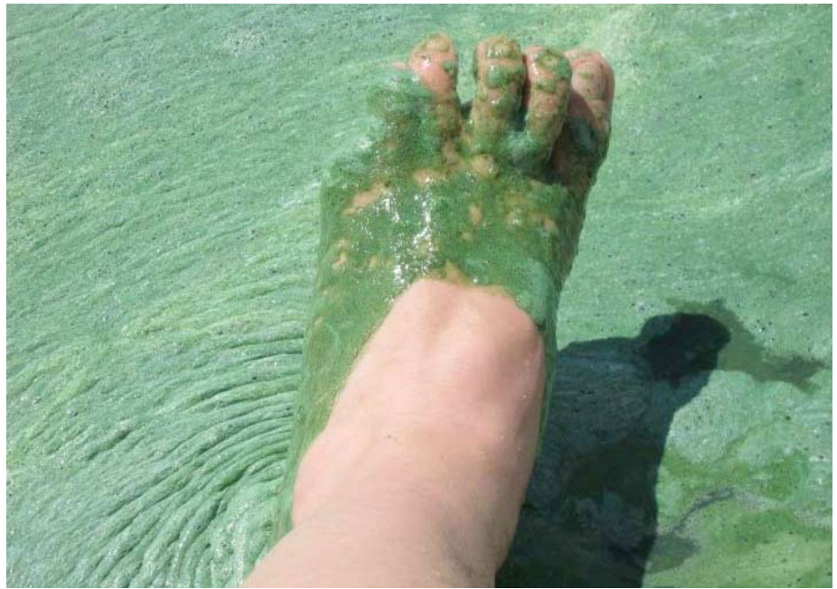
A thick algal scum covers Grand Lake St. Marys.

Because of high levels of anatoxin-a, the Ohio EPA, Ohio Department of Natural Resources,