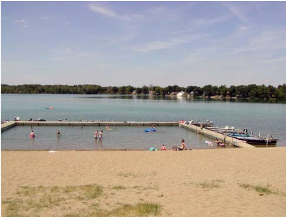
Beach at South Twin Lake, IN.

check with an adult first to be sure it's safe.)