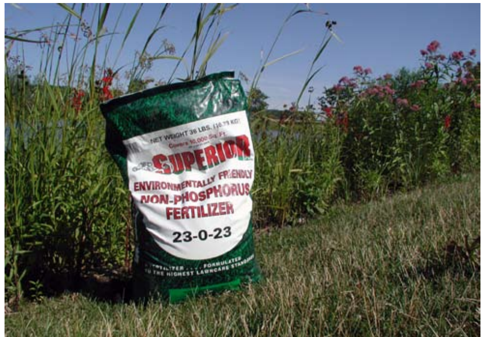
Make certain that the middle number on any lawn fertilizer you buy is "0." This 23-0-23 formula has 23 parts nitrogen, 0 parts phosphorus, and 23 parts potassium.