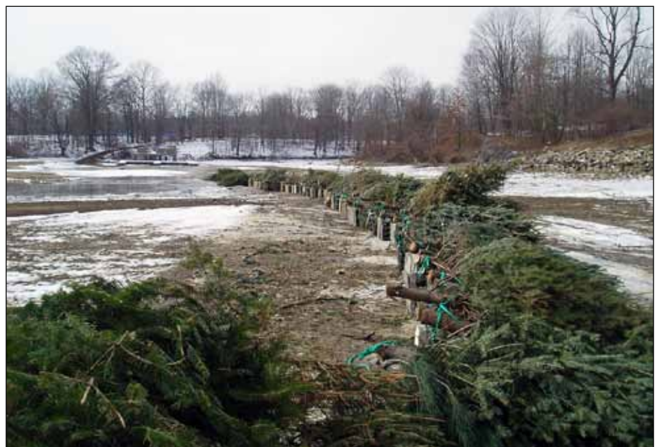
Figure 1. Atwood Lake in northeast Ohio installed 178 fish attractor structures (holiday trees).

If your water body lacks fish cover, one can install artificial structures to attract fish and provide habitat for fish and aquatic insects. While one can purchase a variety of fabricated fish attractors (Figure 2), brush piles are the most common type of fish attractor. Constructed stake beds and evergreen trees are also among the commonly used materials (Figure 3). Whatever type of brush you select, it must be adequately anchored. If the lake in need of these habitat enhancements freezes sufficiently during the winter, the