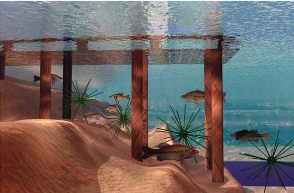
Figure 2. A manufactured Porcupine® Fish Attractor.

fish attractors can be constructed on the ice and allowed to sink in the spring. Otherwise, one would need to boat the materials to the site. The surplus of holiday trees makes them an ideal and abundant brush pile option.